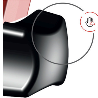
extra reduced radius spin