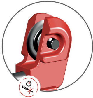
instant wheel change