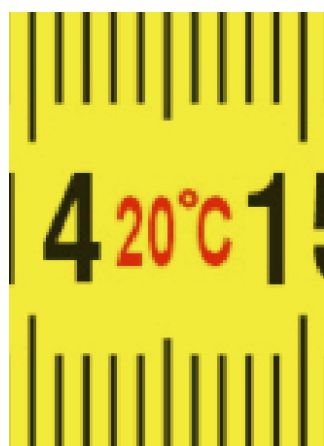
Working temperature condition