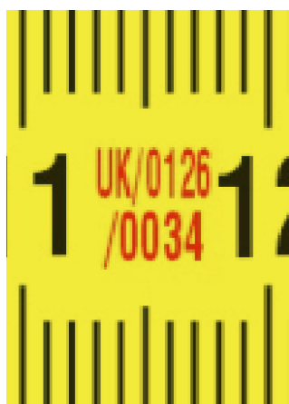
European type approval certificate