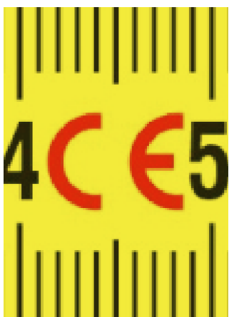
Manufactured in accordance with harmonised standards