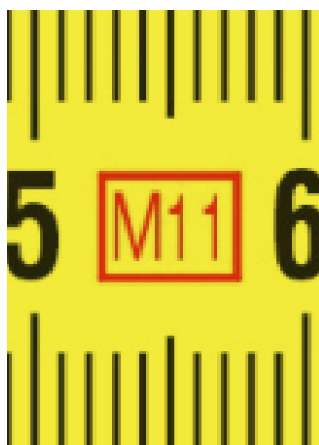
Year of manufacture