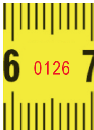
Notified body no.