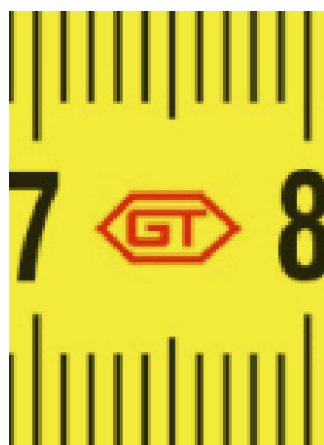
Abbreviations for manufacturer