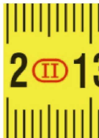
Preciseness to class II