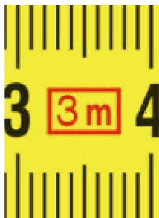
Length of tape